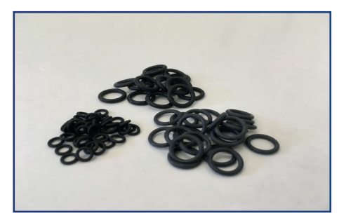
O'rings and tubing