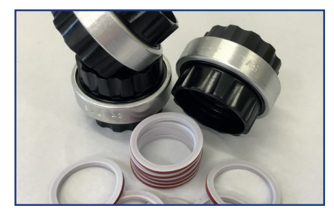
Seals and collection bottles