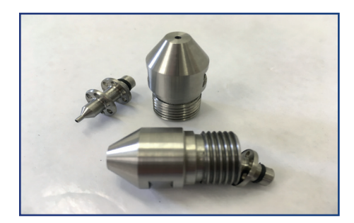
Nozzle assemblies ranging from 0.5mm to 2.0mm

A number of spares and accessories are available to compliment the unit, from nozzles and needles ranging in size to help adjust particles size, to filters to cleanse the exhaust air, and additional glassware for improved particle collection.